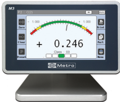
Metro M3 with 2 inputs