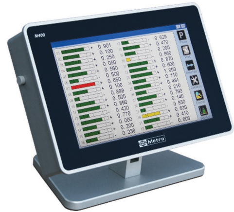
Metro 400 with upto 99 different inputs